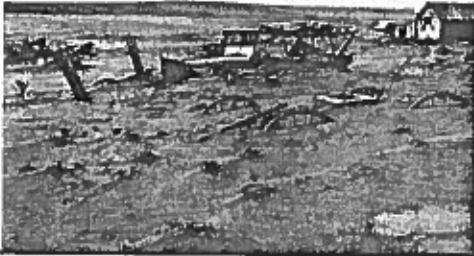
Dustbowl 1936—wind deflation caused mass exodus from great plains